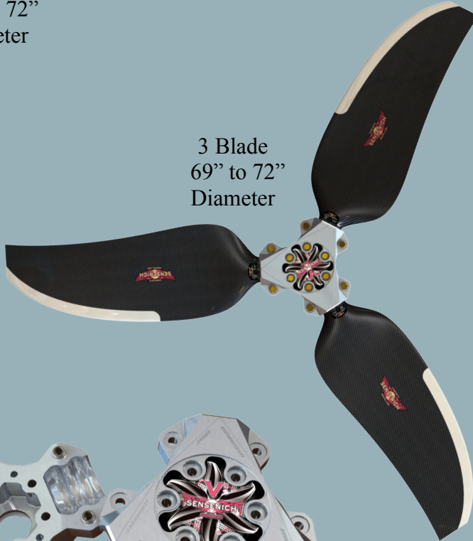
3 Blade 69" to 72" Diameter