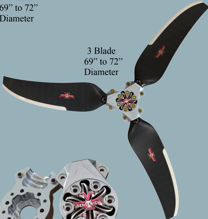
3 Blade 69" to 72" Diameter