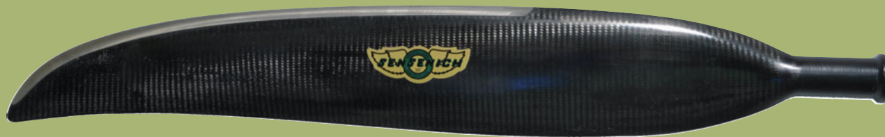
Scimitar Blade with Co-cured Metal Leading Edge Protection