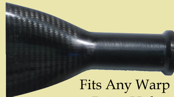
Fits Any Warp Drive Hub