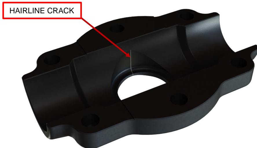
Figure 1. Cracks start near pitch marks and grow outwards.